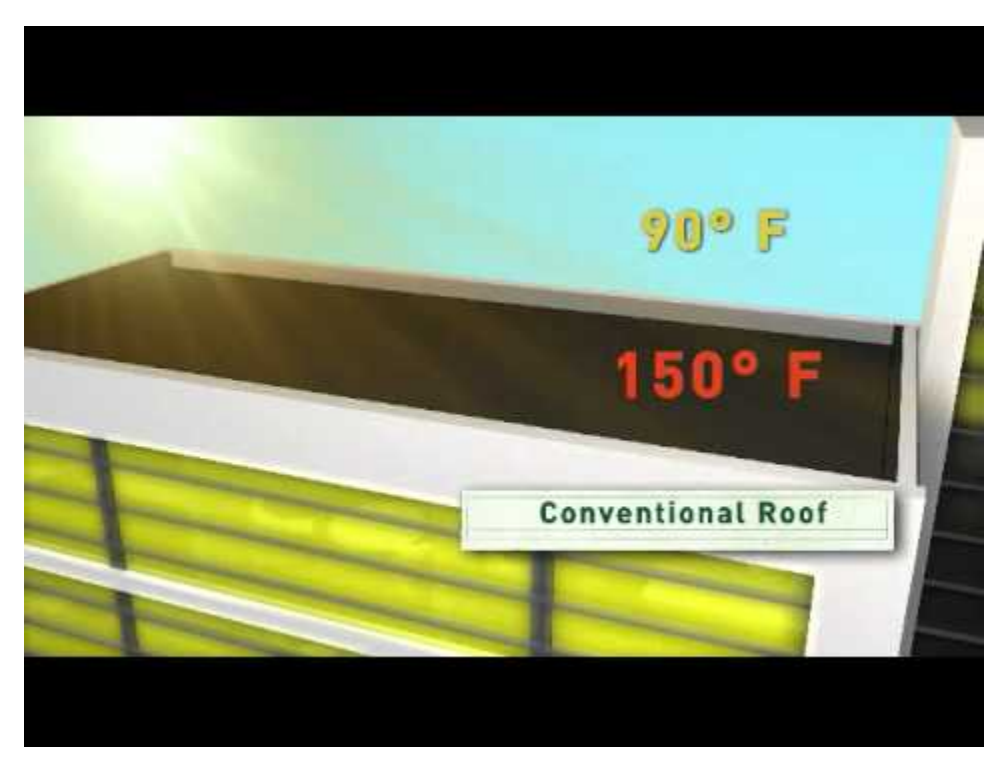
Watch Video At: https://youtu.be/urbpBy Z5lE

Learn how switching to a cool roof can save you money and benefit the environment. U.S. Department of Energy