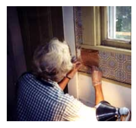
Restoration of decorative paint finishes.

This Brief is about historic interior paints and choosing new paints for historic interiors if repainting is necessary or desirable. It addresses a variety of materials and features: plaster walls and ceilings; wooden doors, molding, and trim; and metal items such as radiators and railings. It provides background information about some of the types of paint which were used in the past, discusses the more common causes and effects of interior paint failure, and explains the principal factors guiding decisions about repainting, including what level of paint investigation may be appropriate. Careful thought should be given to each interior paint project, depending on the history of the building and its painted surfaces.