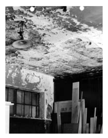
Interior spaces that are being rehabilitated for a new use can benefit from being repainted in historic period colors rather than a neutral off-white.

protect important examples of history or art. If repainting is required, the new paint is matched to existing paint colors using the safer, modern formulations. Recreating earlier surface colors and treatments is not an objective.