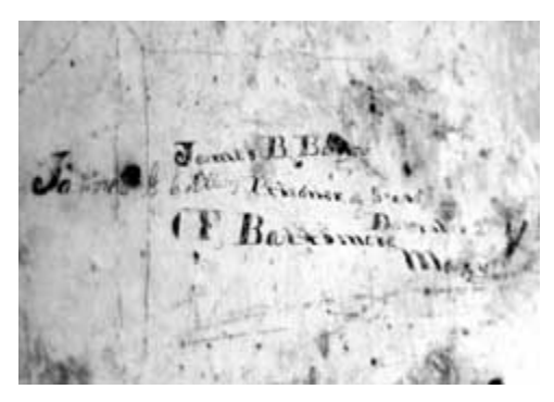
When discovered, important examples of history, such as this pencilled Civil War graffiti, should be preserved.

A paint's patina of age expresses decades or centuries of endurance in the face of changing climate and conditions. Documenting the sequence of interior paint layers and protecting this information for future investigation should be an integral part of any historic preservation project.