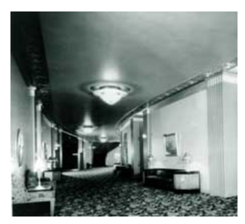
The Art Deco style lobby foyer of the Paramount Theater in Sacramento, California (1931) features painted plaster columns and cornices which have been finished in gold and silver leaf.

Although stenciling, gilding, and faux finishes can be found, they did not express the modern style of the time. On the other hand, glaze treatments were often used in the early 20th century to "antique" walls and trim that had been painted with neutral colors, especially in Spanish Colonial Revival and Mission architecture. The glazes were applied by ragging, sponging, and other techniques which gave an interesting and uneven surface appearance. Colored plasters were sometimes used, and air brushing employed to give a craftsman-like appearance to walls, trim, and ceilings. During the same period, Williamsburg paint colors were produced and sold to people who wanted their houses to have a "historic Georgian look." Churches, country clubs, and many private buildings adopted the Williamsburg style from the late '20s onward.