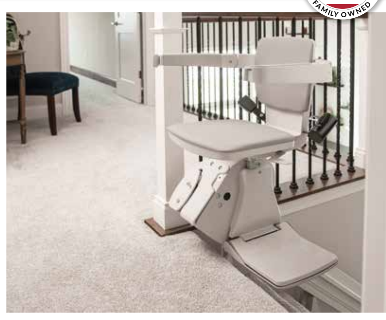
Offset swivel seat makes getting on/off easy.