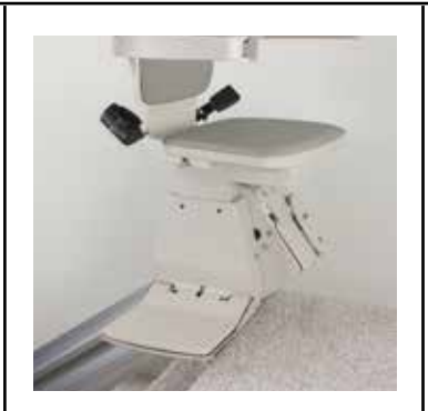
Power swivel seat for effortless exit. Armrest switch control or wireless call/send.