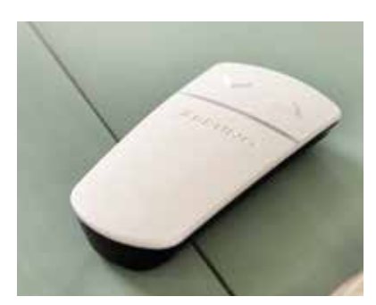
Two wireless call/sends allow remote control access.