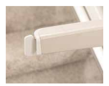
Ergonomic armrest control.