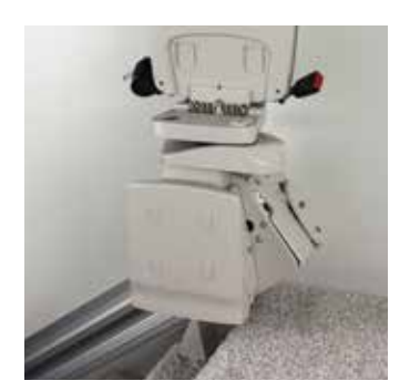
Power folding footrest automatically flips up/down when seat is raised/lowered. Arm switch control optional.