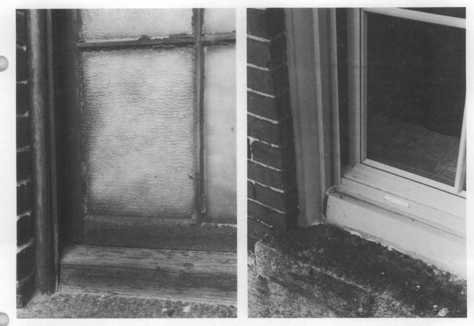
Figure 6. The manufacturer's stock window used for the project unfortunately created the appearance of a double sill, which the historic window never had.

The manufacturer's stock sash accommodated the muntin grid with only minor modification. The stock sash contained a single light of 7/8" thick insulating glass (two 1/8" glass panes separated by a 5/8" air space) fastened in a 1 1/4" thick sash. As modified for the muntin grid, the insulating glass was narrowed to 1/2" (two 1/8" glass panes separated by a 1/4" air space) to provide the depth for the grid to be contained within the sash. The beveled edge of the muntins was continued around the glass edge of the rails and stiles as well, in order to duplicate the angled putty seal line of the original sash. The grid was securely set into the sash frame as the sash was being assembled.