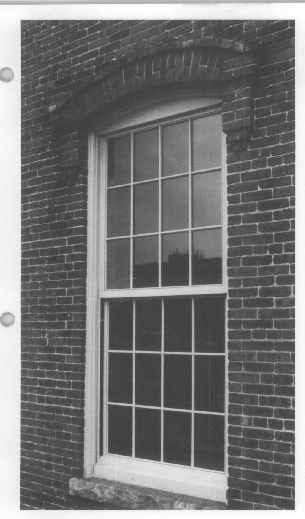
Figure 7. Replacement window after installation.