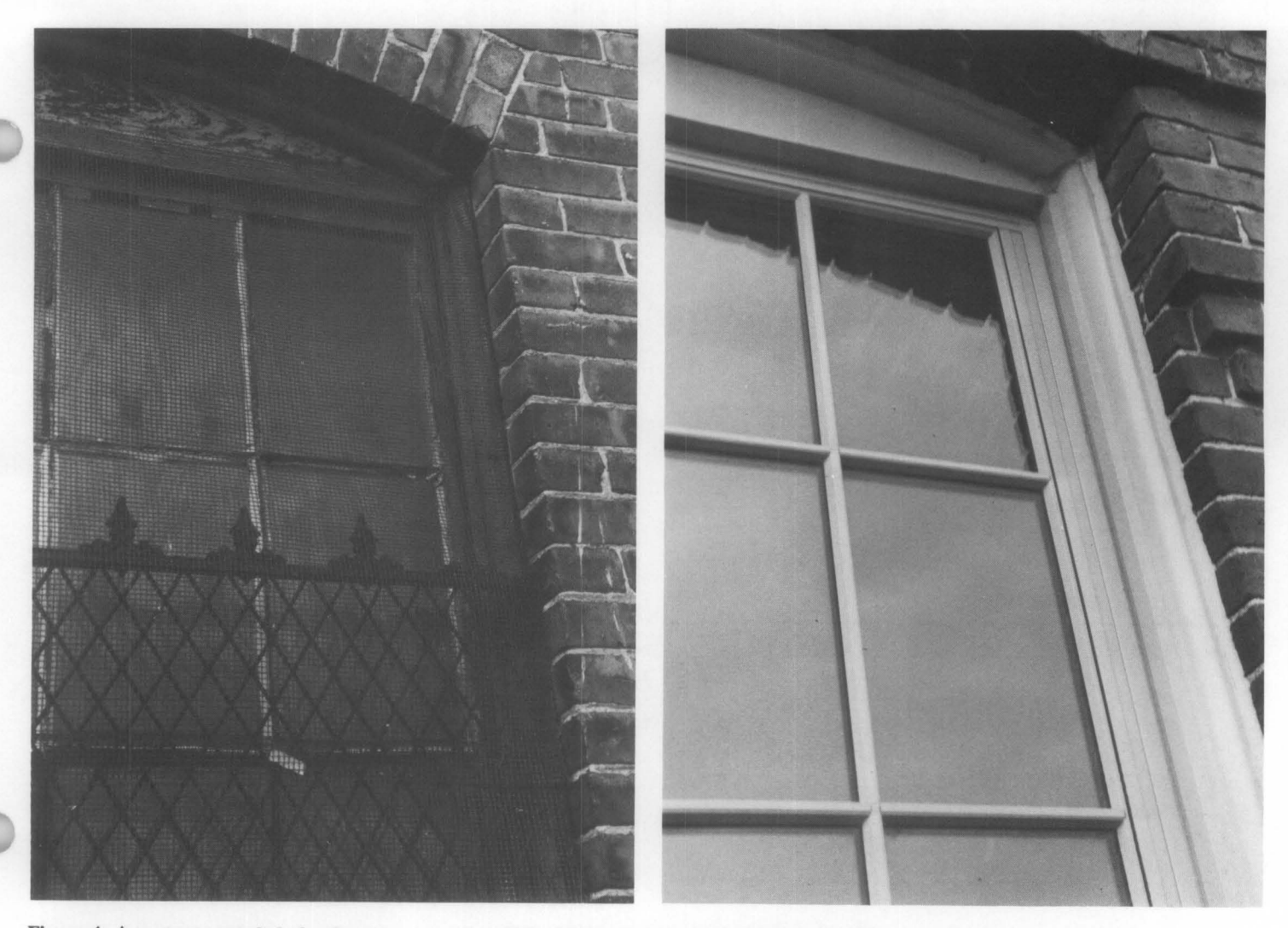
Figure 4. A custom-extruded aluminum pan was installed, duplicating the brick molding detail and, at the head of the frame, custom bent to follow the segmental curve of the masonry opening.