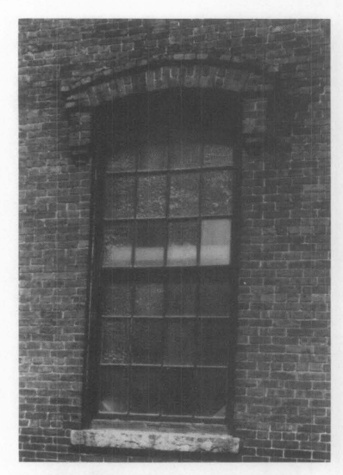
Figure 1. The original wooden doublehung windows consisted of 12 lights in both the upper and lower sash.