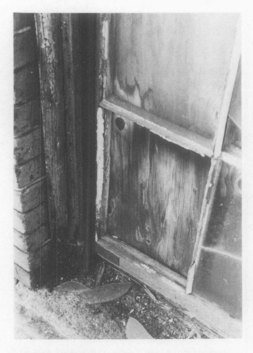
Figure 2. The condition of the windows varied considerably. Shown here is a typical case where the frame, sill and sash were beyond repair.

four aluminum windows were installed as part of the selection process, along with the one vinyl and one aluminum-cladded wooden unit.