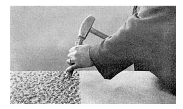
Historically, a point finish was put on with a single pointed chisel.

High quality cast stone was frequently "cut" or tooled with pneumatic chisels and hammers similar to those used to cut natural stone. In some cases, rows of small masonry blades were used to create shallow parallel grooves similar to lineal chisel marks. The results were often strikingly similar in appearance to natural stone. Machine and hand tooling was expensive, however, and simple molded cut cast stone was sometimes only slightly less costly than similar work in limestone. Significant savings could be achieved over the cost of natural stone when repetitive units of ornate carved trim were required.