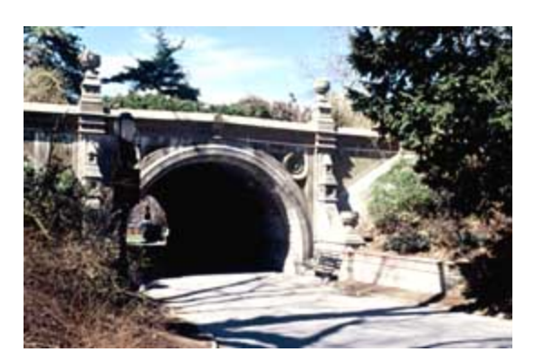
Constructed in 1868 of Beton Coignet, the Cleft Ridge Span in New York City's Prospect Park is one of the earliest extant cast stone structures in the United States.

Another product which utilized natural cement as its cementing agent was Beton Coignet (literally, "Coignet concrete," also known as "Coignet Stone"). Francois Coignet was a pioneer of concrete construction in France. He received United States patents in 1869 and 1870 for his system of pre-cast concrete construction, which consisted of portland cement, hydraulic lime, and sand. In the United States the formula was modified to a mix of sand with Rosendale Cement ( a high quality natural cement manufactured in Rosendale, Ulster County, New York). In 1870 Coignet's U.S. patent rights were sold to an American, John C. Goodrich, Jr., who formed the New York and Long Island Coignet Stone Company. This company fabricated the cast