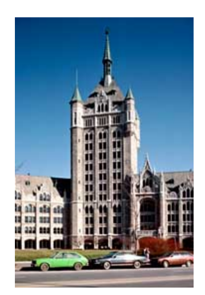
The prominent Delaware and Hudson Building, Albany, New York, (1916) made extensive use of cast stone as trim combined with a random ashar facing of natural granite.

During a century and a half of use in the United States, cast stone has been given various names. While the term "artificial stone" was commonly used in the 19th century, "concrete stone," "cast stone," and "cut cast stone" replaced it in the early 20th century. In addition, Coignet Stone, Frear Stone, and Ransome Stone were all names of proprietary systems for precast concrete building units, which experienced periods of popularity in different areas of the United States in the 19th century. These systems may be contrasted with "Artistic