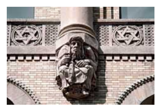
Sculptural ornament was frequently produced in cast stone. Repetitive detail, such as these banding course panels on the Level Club in New York City (1926), were produced much more economically than they could be in natural stone.

Having gained popularity in the United States in the 1860s, cast stone had become widely accepted as an economical substitute for natural stone by the early decades of the 20th century. Now, it is considered an important historic material in its own right with unique deterioration problems that require traditional, as well as innovative solutions. This Preservation Brief discusses in detail the maintenance and repair of historic cast stone-precast concrete building units that simulate natural stone. It also covers the conditions that warrant replacement of historic cast stone with appropriate contemporary concrete products and provides guidance on their replication. Many of the issues and techniques discussed here are relevant to the repair and replacement of other precast concrete products, as well.