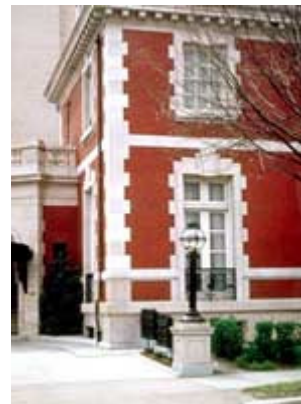
The decorative trim on this brick building is architectural terra-cotta intended to simulate the limestone foundation.

The construction of the building must be considered when developing a cleaning program because inappropriate cleaning can have a deleterious effect on the masonry as well as on other building materials. The masonry material or materials must be correctly identified. It is sometimes difficult to distinguish one type of stone from another; for example, certain sandstones can be easily confused with limestones. Or, what appears to be natural stone may not be stone at all, but cast stone or concrete. Historically, cast stone and architectural terra cotta were frequently used in combination with natural stone, especially for trim elements or on upper stories of a building where, from a distance, these substitute materials looked like real stone. Other features on historic buildings that appear to be stone, such as decorative cornices, entablatures and window hoods, may not even be masonry, but metal.