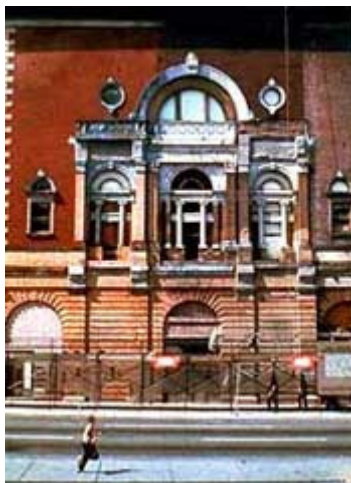
Ninety years of accumulated dirt and pollutants are being removed from this historic theater using an appropriate chemical cleaner, applied in stages.

Inappropriate cleaning and coating treatments are a major cause of damage to historic masonry buildings. While either or both treatments may be appropriate in some cases, they can be very destructive to historic masonry if they are not selected carefully. Historic masonry, as considered here, includes stone, brick, architectural terra cotta, cast stone, concrete and concrete block. It is frequently cleaned because cleaning is equated with improvement. Cleaning may sometimes be followed by the application of a water-repellent coating. However, unless these procedures are carried out under the guidance and supervision of an architectural conservator, they may result in irrevocable damage to the historic resource.