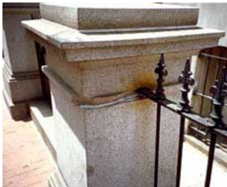
The iron stain on this granite post may be removed by applying a commercial rust-removal product in a poultice.

Graffiti and stains, which have penetrated into the masonry, often are best removed by using a poultice. A poultice consists of an absorbent material or clay powder (such as kaolin or fuller's earth, or even shredded paper or paper towels), mixed with a liquid (a solvent or other remover) to form a paste which is applied to the stain. The poultice is kept moist and left on the stain as long as necessary for it to draw the stain out of the masonry. As it dries, the paste absorbs the staining material so that it is not redeposited on the masonry surface.