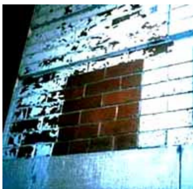
Any cleaning method should be tested before using it on historic masonry.

Identify prior treatments. Previous treatments of the building and its surroundings should be researched and building maintenance records should be obtained, if available. Sometimes if streaked or spotty areas do not seem to get cleaner following an initial cleaning, closer inspection and analysis may be warranted. The discoloration may turn out not to be dirt but the remnant of a water-repellent coating applied long ago which has darkened the surface of the masonry over time. Successful removal may require testing several cleaning agents to find something that will dissolve and remove the coating. Complete removal may not always be possible. Repairs may have been stained to match a dirty building, and cleaning may make these differences apparent. De-icing salts used near the building that have dissolved can migrate into the masonry. Cleaning may draw the salts to the surface, where they will appear as efflorescence (a powdery, white substance), which may require a second treatment to be removed. Allowances for dealing with such unknown factors, any of which can be a potential problem, should be included when investigating cleaning methods and materials. Just as more than one kind of masonry on a historic building may necessitate multiple cleaning approaches, unknown conditions that are encountered may also require additional cleaning treatments.