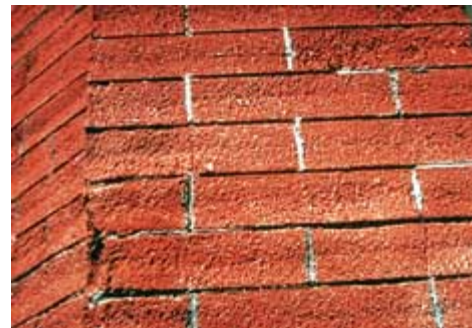
Sandblasting has permanently damaged this brick wall.

Abrasive Blasting. Blasting with abrasive grit or another abrasive material is the most frequently used abrasive method. Sandblasting is most commonly associated with abrasive cleaning. Finely ground silica or glass powder, glass beads, ground garnet, powdered walnut and other ground nut shells, grain hulls, aluminum oxide, plastic particles and even tiny pieces of sponge, are just a few of the other materials that have also been used for abrasive cleaning. Although abrasive blasting is not an appropriate method of cleaning historic masonry, it can be safely used to clean some materials. Finely-powdered walnut shells are commonly used for cleaning monumental bronze sculpture, and skilled conservators clean delicate museum objects and finely detailed, carved stone features with very small, micro-abrasive units using aluminum oxide.