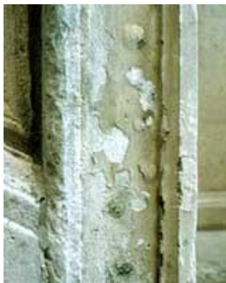
This clear coating has failed and is pulling off pieces of the stone as it peels.

Water-repellent coatings are formulated to be vapor permeable, or "breathable". They do not seal the surface completely to water vapor so it can enter the masonry wall as well as leave the wall. While the first water-repellent coatings to be developed were primarily acrylic or silicone resins in organic solvents, now most water-repellent coatings are water-based and formulated from modified siloxanes, silanes and other alkoxysilanes, or metallic stearates. While some of these products are shipped from the factory ready to use, other water-borne water repellents must be diluted at the job site. Unlike earlier water-repellent coatings which tended to form a "film" on the masonry surface, modern water-repellent coatings actually penetrate into the masonry substrate slightly and, generally, are almost invisible if properly applied to the masonry. They are also more vapor permeable than the old coatings, yet they still reduce the vapor permeability of the masonry. Once inside the wall, water vapor can condense at cold spots producing liquid water which, unlike water vapor, cannot escape through a water-repellent coating. The liquid water within the wall, whether from condensation, leaking gutters, or other sources, can cause considerable damage.