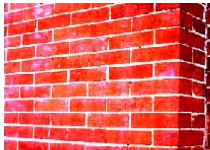
Improper cleaning methods may have been responsible for the formation of

Anti-graffiti or barrier coatings are another type of clear coating--although barrier coatings can also be pigmented--that may be applied to exterior masonry, but they are not formulated primarily as water repellents. The purpose of these coatings is to make it harder for graffiti to stick to a masonry surface and, thus, easier to clean. But, like water-repellent coatings, in most cases the application of anti-graffiti coatings is generally not recommended for historic masonry buildings. These coatings are often quite