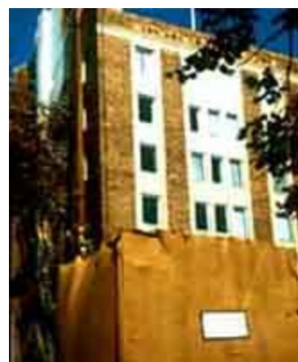
The lower floors of this historic brick and architectural terra-cotta building have been covered during chemical cleaning to protect pedestrians and vehicular traffic from potentially harmful overspray.

Safety considerations. Possible health dangers of each method selected for the cleaning project must be considered before selecting a cleaning method to avoid harm to the cleaning applicators, and the necessary precautions must be taken. The precautions listed in Material Safety Data Sheets (MSDS) that are provided with chemical products should always be followed. Protective clothing, respirators, hearing and face shields, and gloves must be provided to workers to be worn at all times. Acidic and alkaline chemical cleaners in both liquid and vapor forms can also cause serious injury to passers-by. It may be necessary to schedule cleaning at night or weekends if the building is located in a busy urban area to reduce the potential danger of chemical overspray to pedestrians. Cleaning during non-business hours will allow HVAC systems to be turned off and vents to be covered to prevent dangerous chemical fumes from entering the building which will also ensure the safety of the building's occupants. Abrasive and mechanical methods produce dust which can pose a serious health hazard, particularly if the abrasive or the masonry contains silica.