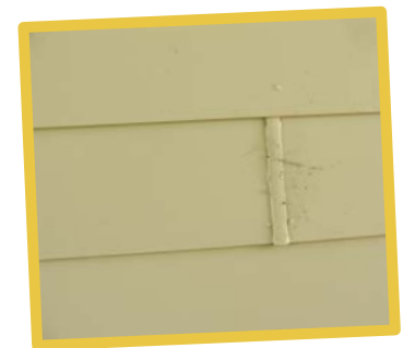
Hardi plank wall sheeting