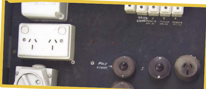
Zelemite backing board to an external switchboard