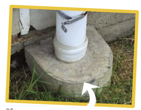
DT surround (disconnector trap)