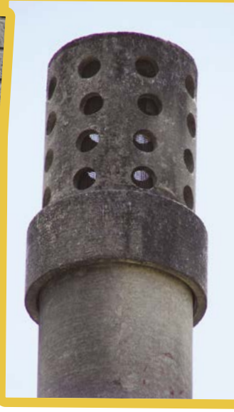
Vent pipe cap and socket fitted over a vent pipe