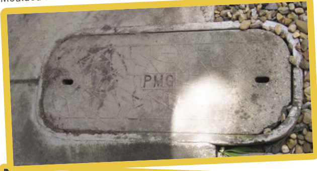
Moulded telecommunications pit