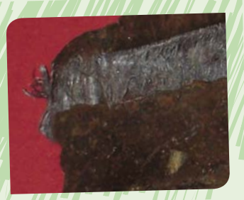
Crocidolite asbestos (blue)

Asbestos fibres are 50–200 times thinner than a human hair, can float in the air for a long time, can be invisible to the naked eye and can be breathed into the lungs.