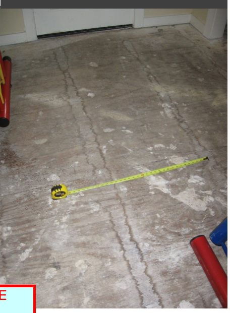
Figure 2. Subfloor with moisture damage in a house with impermeable vinyl flooring (removed) above a vented crawl space

conditioned) crawl space: a crawl space with a continuous perimeter foundation wall that is sealed (no wall vents) to improve energy and moisture performance. Insulation is installed on foundation walls or in floors above. Humidity is controlled by a dehumidifier, exhaust venting, or HVAC system [2].