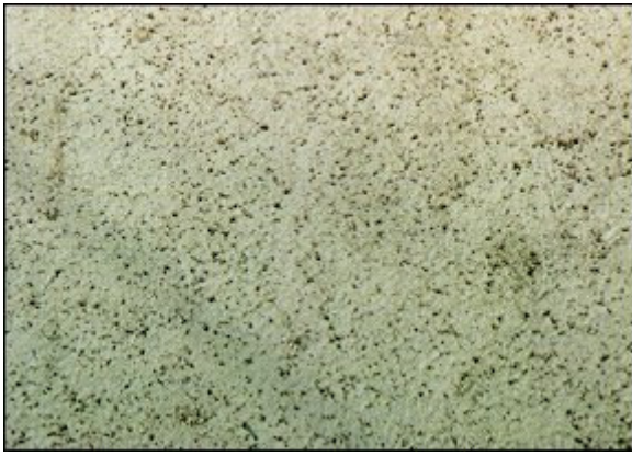
Figure 4. Closeup of sooty mold colonies on surface of propane tank.