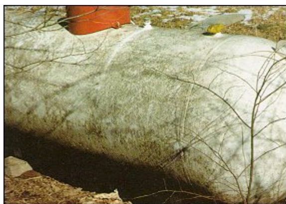
Figure 3. Propane tank under black walnut tree with sooty mold growth on it.

Sooty mold coverings on leaves block light, making photosynthesis less efficient. On outdoor structures and furniture, sooty mold growths are unsightly and may be difficult to remove (figs. 3-6). Many people are allergic to sooty molds, particularly the Cladosporium and Aureobasidium components common in sooty molds of the Eastern U.S.