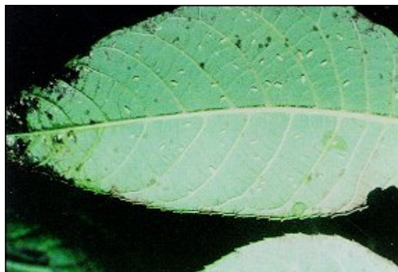
Figure 2. Aphids on undersurface of black walnut leaflet.

Sooty mold growth is of two types. The first is a deciduous growth on leaves, which lasts for the life of the leaf. The second is persistent growth on stems and twigs of woody plants and on humanmade structures. In this type, growth is renewed from existing mycelium of the fungi produced the previous season.