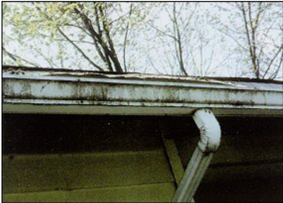
Figure 6. Sooty mold growth on house rain gutter located below a silver maple tree.