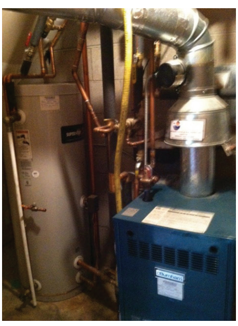
An indirect water heater: the blue boiler heats water in a pipe that runs in a coil through the storage tank for both space and domestic hot water heating.

Indirect water heaters consist of a single boiler, a stand-alone storage tank for both domestic hot water and space heating, piping, and other associated components. Water is run in a piping loop from the boiler (where it is heated) through a coil in the storage tank. In the storage tank the coil of water exchanges its heat with the surrounding storage water before returning to the boiler. Domestic hot water is usually controlled as its own 'zone' of the house. In warm weather, the boiler is used only to produce domestic hot water. In cold weather, very little extra energy is used