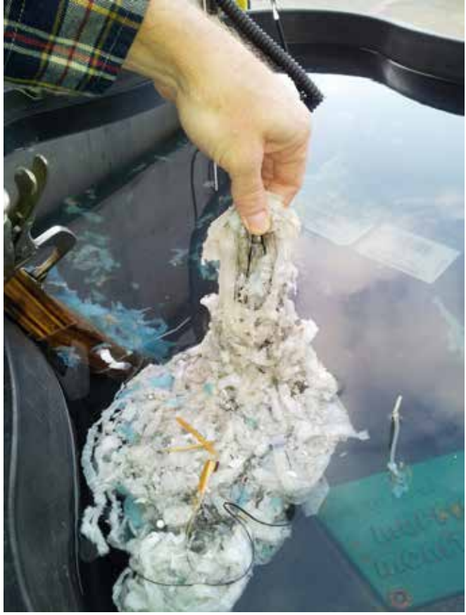
Rag balls form in collections systems when debris and hair knit together. Research revealed that hair is the main catalyst for the rag balls.

The team purchased a wide range of consumer wipes to test, including flushable wipes, household cleaning wipes, healthcare wipes, shop towels, shop rags, and diapers – all of which are found regularly in the wastestream. The protocol called for presoaking items for 15 minutes, grinding them, allowing them to circulate through the pumps for 7 minutes and then capturing the material to transfer to the reweave pond. Figure 1 (p. 53) shows the long strips created by a traditional cutter configuration.