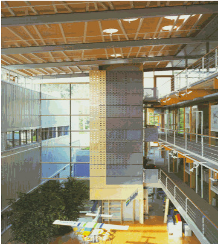
Fig. 8 Bureau Building, Sortimo

The Building Products Division's net sales in 1997 were FIM 542.7 million (FIM 566.9) and employed 657 people in the end of the year 1997.