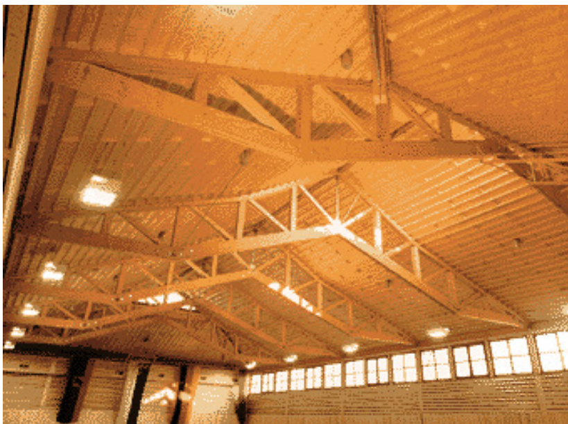
Fig. 6 Roof construction out of LVL-beams, Parkstein, Germany