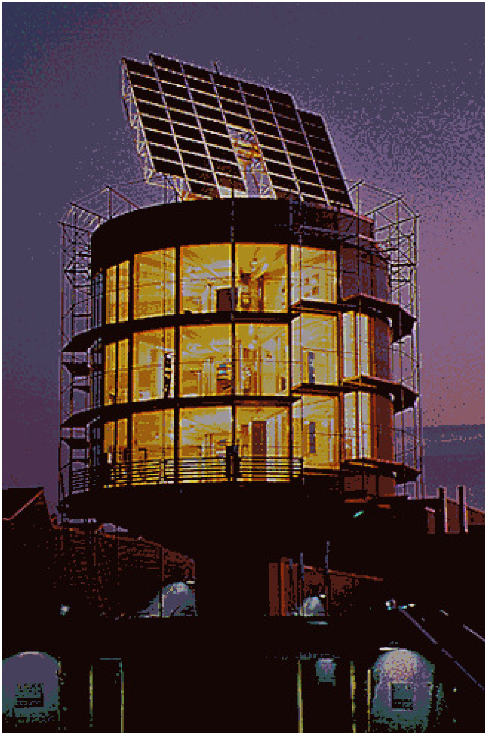
Fig. 8 Solar tower "Heliotrop", Freiburg, Germany