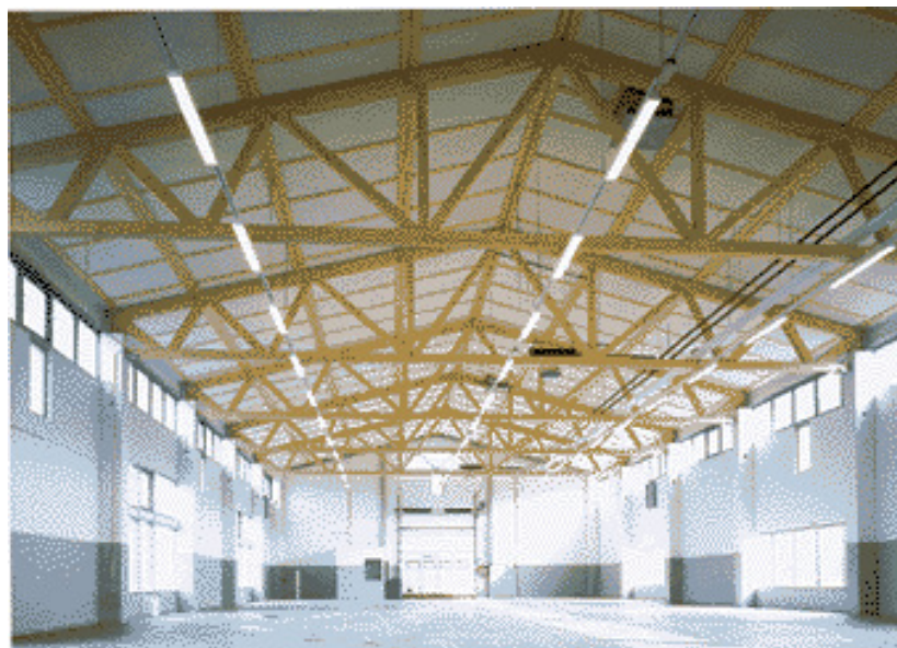
Fig. 10 Frame truss in Espoo, Finland