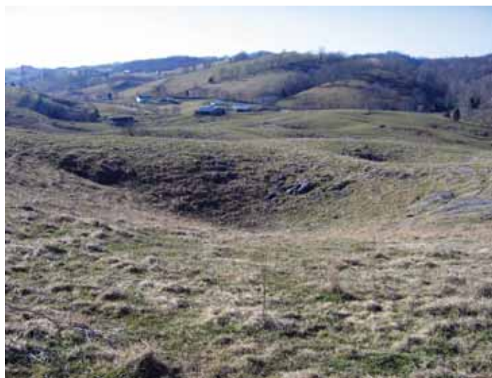
Figure 1. Sinkhole in Russell County, Virginia.

The lowering of the water table in unconsolidated materials or soils, especially near the soil-bedrock interface, can result in the draining of voids caused by the dissolution of bedrock or the removal of soil by groundwater flow. The soil at the top of a recently dewatered void, the soil arch, is subject to increased force (effective stress) because of the loss of the “buoyant” support of the water. Wet soil weighs more and has less strength than if it were dry. If the strength of the wet soil is insufficient, the soil arch will fail.