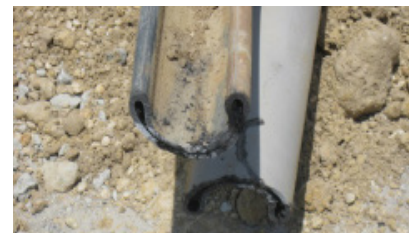
Buried pipe collapsed due to exposure to excessive temperatures