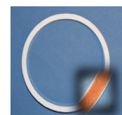
Cellular core of PVC stained orange for identification

Cellular, or foam, core PVC and ABS pipe is extruded with a layer of foam sandwiched between inner and outer layers of solid plastic. Due to decreased pipe stiffness and less resistance to mechanical cleaning, some specifiers find cellular core PVC is not suited for commercial applications. If cellular core pipe is used, specifiers should confirm the material installed is consistent with their specification and with the requirements of the application.