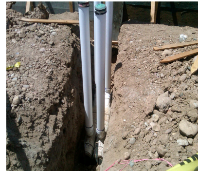
Trench width is too narrow, two pipes buried directly adjacent to one another and improper bedding